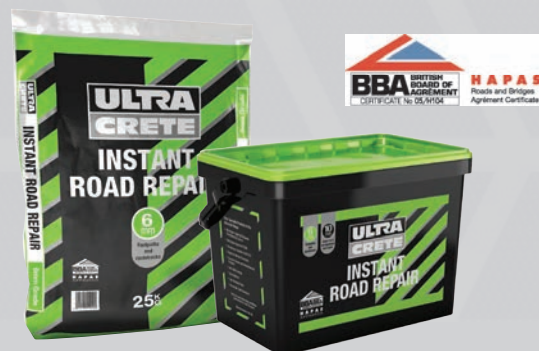
New Packaging from Nov 2010!